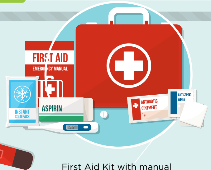
First Aid Kit with manual