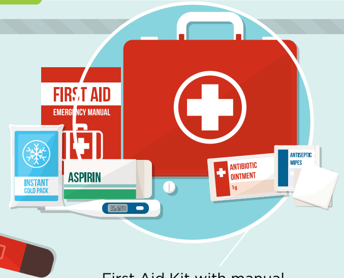
First Aid Kit with manual