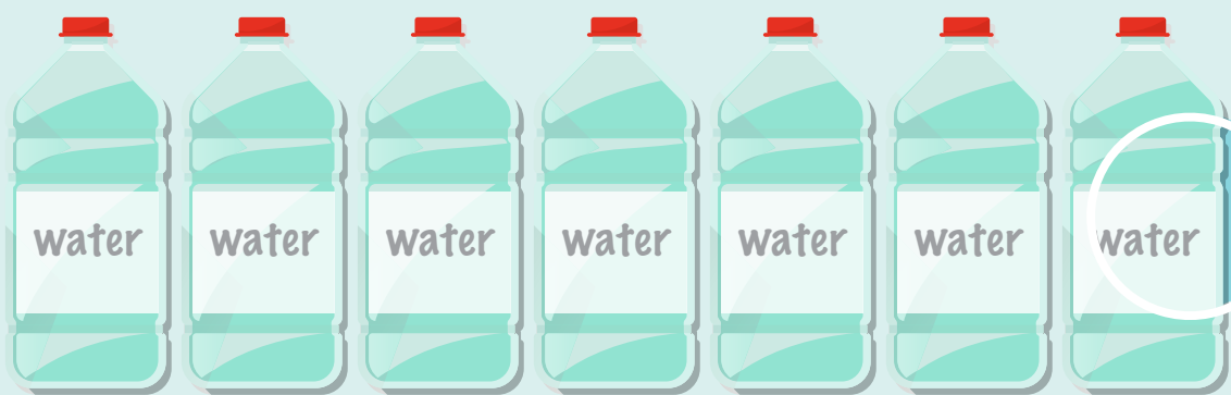
7-day supply of water one gallon a day per person