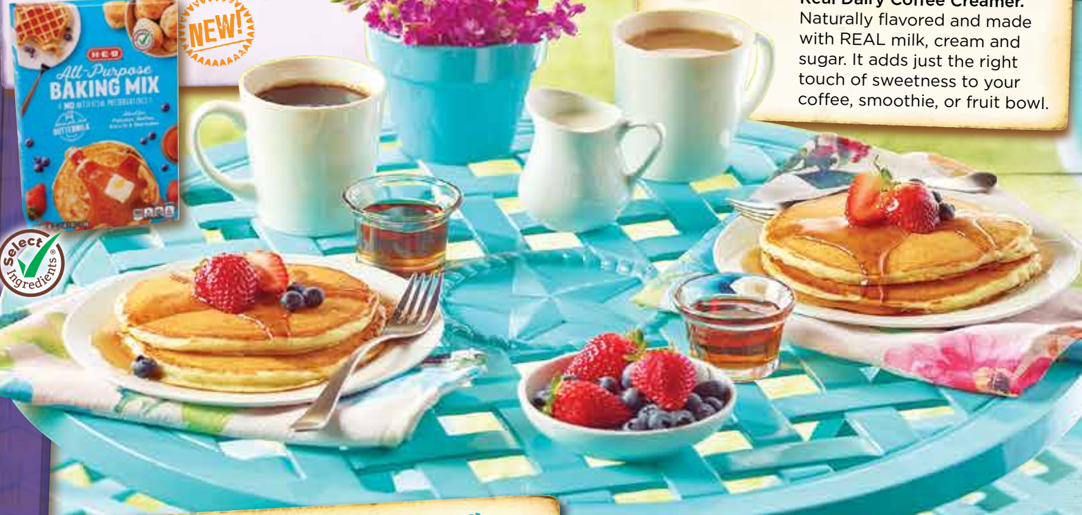
Table For Two - IN BLUE!

Kick start your morning with the strong, bold flavor of 4J Kenya Signature Coffee . This high-quality specialty blend of apricot, white wine, fruit acids and thick, dark chocolate was created by four chefs looking to bring the same excellence to coffee that they do to food. Enjoy alone or with a splash of H-E-B Select Ingredients Real Dairy Coffee Creamer . Naturally flavored and made with REAL milk, cream and sugar. It adds just the right touch of sweetness to your coffee, smoothie, or fruit bowl.