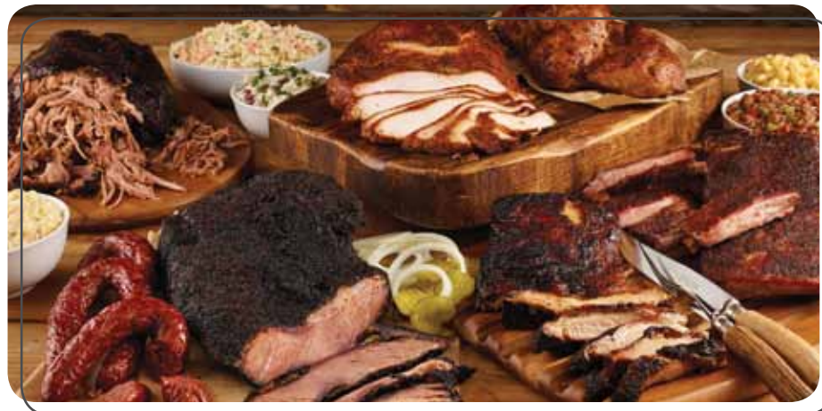
True Texas BBQ is slow smoked over Texas Post Oak. Served with pickles, onions and bread