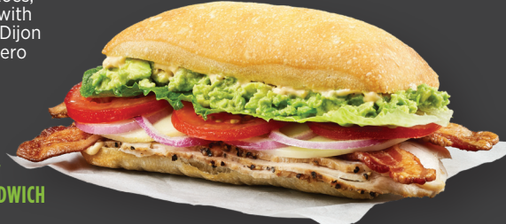
CHIPOTLE TURKEY BACON & AVOCADO SANDWICH

In-house roasted beef, H-E-B Artisan cheddar, tomatoes, red onions & romaine, with horseradish mayo and Dijon mustard, served on a hero