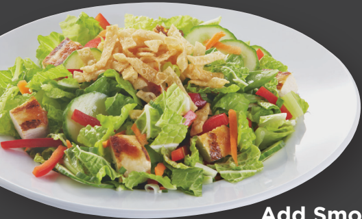
ASIAN CHICKEN SALAD

Napa cabbage, romaine lettuce, red peppers, cucumbers, and carrots, topped with grilled chicken, wonton strips & tossed in a citrus ginger dressing