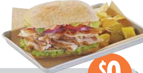
CHIPOTLE TURKEY, BACON & AVOCADO

SUNDAY SUPPER Hand-battered chicken tenders, crispy mac 'n' cheese, topped with lettuce, onions, pickles & comeback sauce served on Texas toast ..... 9