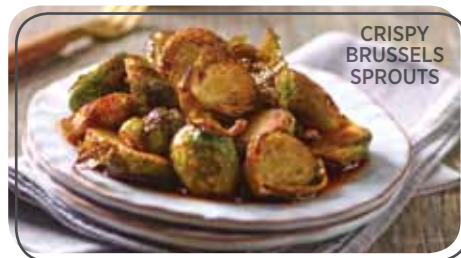
CRISPY BRUSSELS SPROUTS

MEDITERRANEAN PLATE Avocado kale mash, roasted garlic hummus & lemon pepper ricotta bruschetta with marinated H-E-B Zeema Tomatoes ..... 8