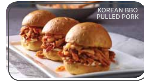
KOREAN BBQ PULLED PORK