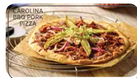
CAROLINA BBQ PORK PIZZA

PROSCIUTTO & ARUGULA Lemon pepper ricotta, fresh mozzarella, prosciutto, arugula & lemon vinaigrette..... 8