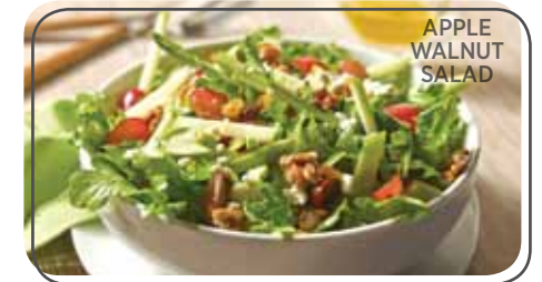
APPLE WALNUT SALAD

ASIAN CHICKEN Napa cabbage, romaine, snow peas, red peppers, cucumbers, carrots, topped with grilled chicken, wonton strips & tossed in a miso dressing..... 10